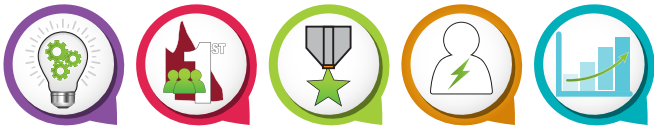
Ideas in action Customers first Be courageous Empower people Unleash potential