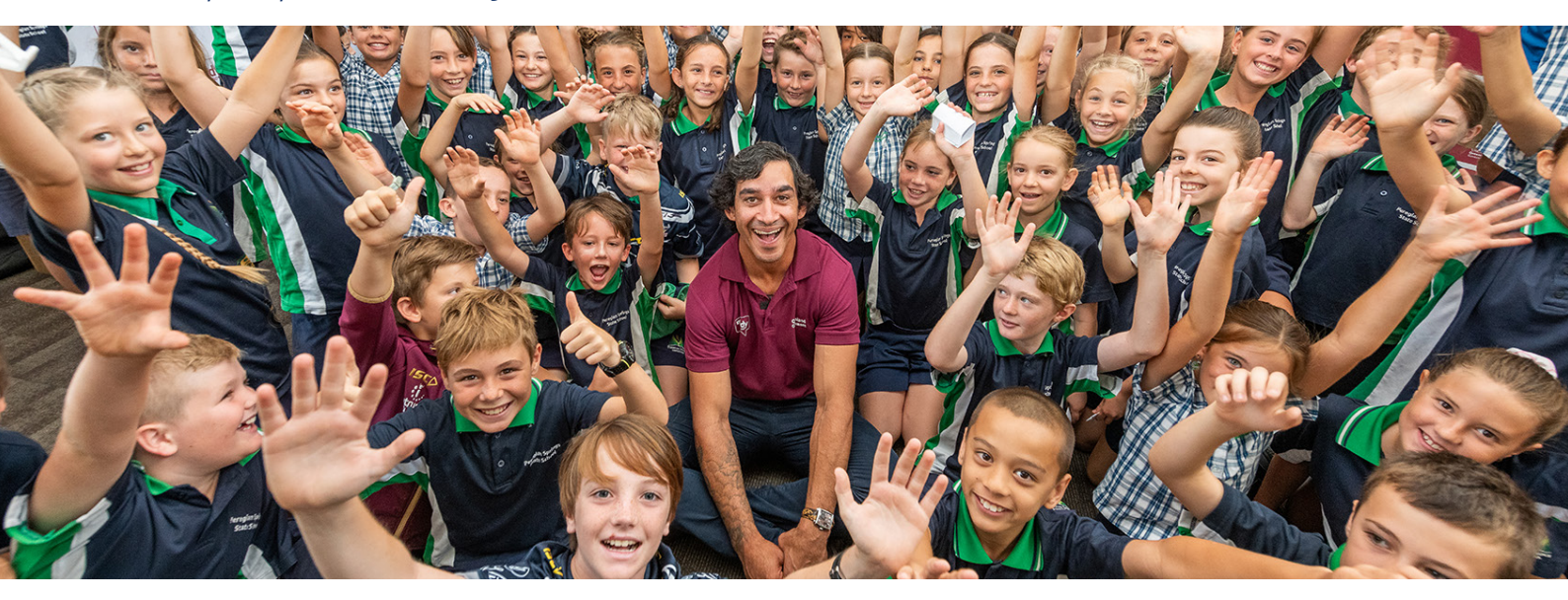
Image: Grade Four students from Peregian Springs State enjoyed a visit from Get Ready Queensland Ambassador Johnathan Thurston as the winners of the 2020 Get Ready Queensland Schools Competition.

The 2020 Get Ready Queensland Schools competition received nearly 100 entries from 31 Queensland Local Government areas, with participation from over 1,500 students.