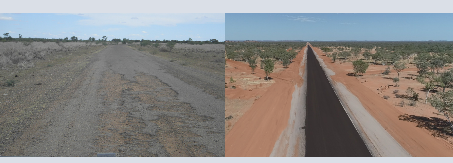
Image (L): Sedan Dip Road prior to Betterment (R) Betterment works complete – November 2020.

The Sedan Dip Road Betterment works were delivered through the $242 million extraordinary assistance package funded by Commonwealth and Queensland Governments under the Disaster Recovery Funding Arrangements (DRFA).