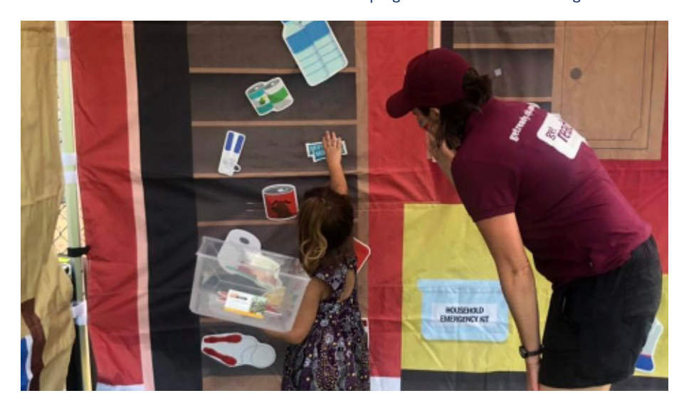
Image: The Get Ready Queensland team set up an interactive marquee which challenged children to decide which items to include and leave out of their emergency and evacuation kits.

The market research will inform whether the campaign creative will be used again in 2021-22.