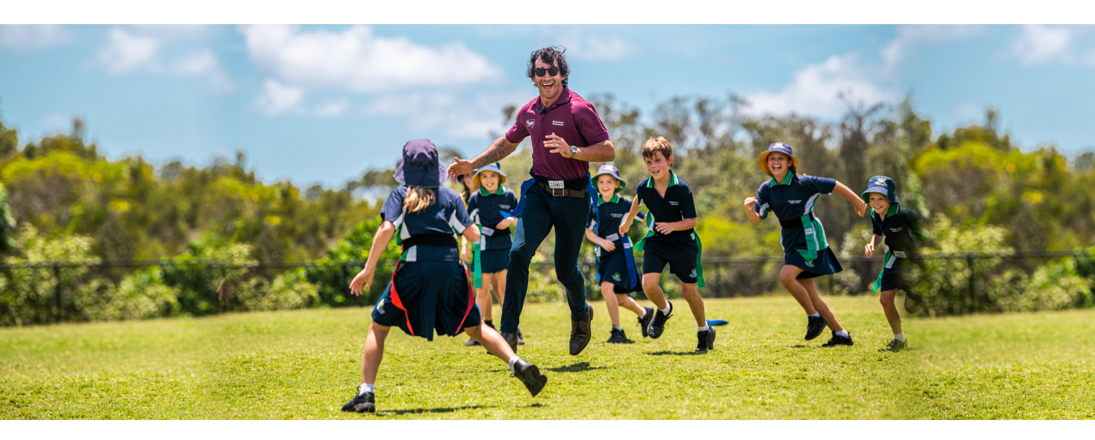
Image: Get Ready Queensland Ambassador Johnathan Thurston enjoys the day with winners of the 2020 Get Ready Queensland Schools Competition.